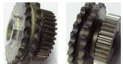
Removal of grease and silicone