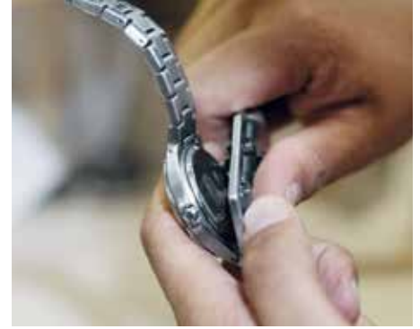
Cleaning of watch parts like straps, cases, etc.

Elmasonic xtra TT tabletop ultrasonic devices are designed for use in production environments, workshops and servicing. Features like the permanently integrated Sweep-function, the switchable Dynamic-function or the individually settable limit temperature with LED warning indicator make the cleaning of parts in day to day work much easier.