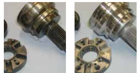
Removal of oxidation and other contaminants