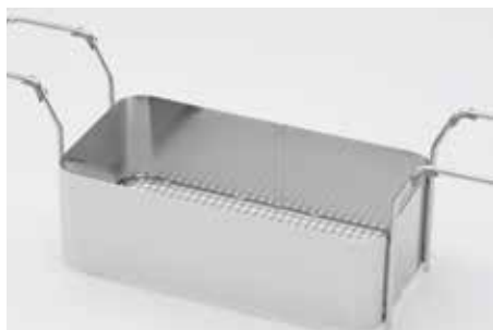
Baskets made of stainless steel