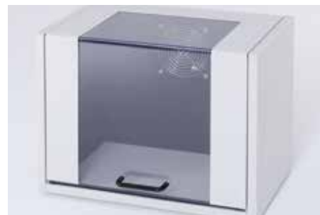
Noise protection box