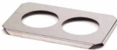
Perforated cover for using beakers