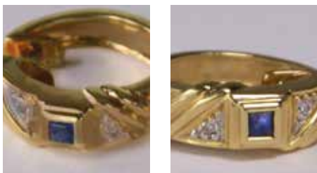
Removal of wear dirt