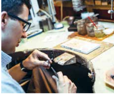
Cleaning of rings, necklaces, earrings, etc.