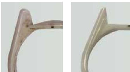
Removal of polishing pastes