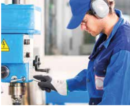
Industrial parts cleaning of motor parts, filters, etc.

Robust tabletop ultrasonic devices for heavy-duty applications