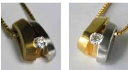
Removal of polishing pastes